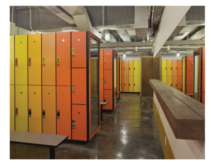
Figure 7. 14th Street Y Community Center Locker Rooms. Photography: Bilyana Dimitrova.

specificity of each function and space while maintaining a coherence through a unifying overall organization and style.