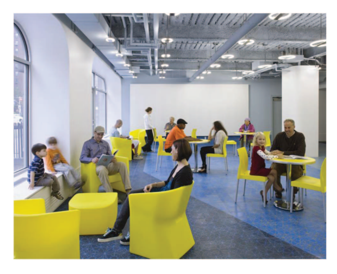
Figure 6. 14th street Y Community Center Lobby.

The renovated 14 Street Y community center celebrates the diversity of its multigenerational, multiethnic membership. The ground floor program of lobby, fitness center, locker rooms, offices, showers, and pool were reorganized as a series of parallel bands, each with its own identity pattern. As members move through the different bands, they experience the simultaneous happenings that animate the building. By using off-the-shelf materials in unconventional ways, we created an unusual design within a limited budget. Fields of fluorescent light fixtures of different sizes redraw the ceiling, while bands of colored yellow and blue floor tiles reconfigure the floor space, marking different lobby activities such as registration, café, and lounge seating (Figures 6 and 7). We aimed to express the