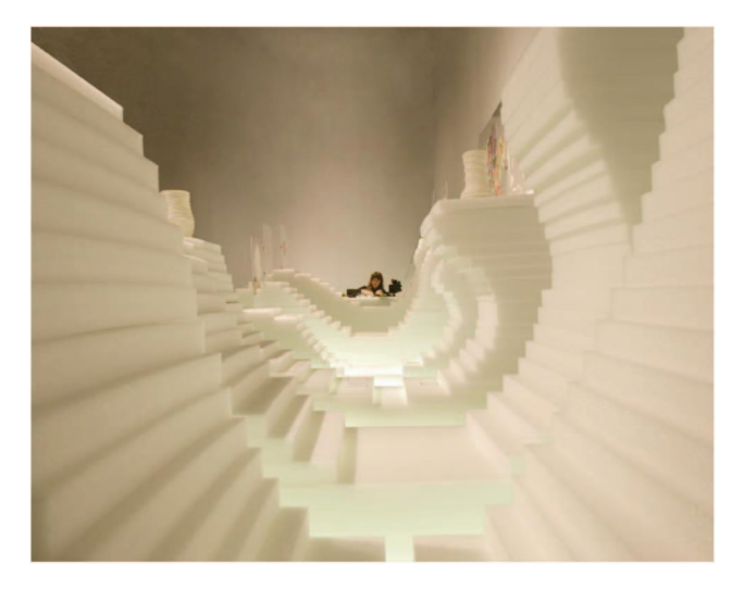
Figure 2. Off the Wall Exhibition, Pedestal Mountain. See the online article for the color version of this figure.

of tactile display pedestals made of layered white ester foam. The heights and sizes of the mountains varied, corresponding to specific requirements of each exhibited object and the artist's workspace needs. A third gallery exhibited music created by two DJs. The spaces were covered with a large Pixilated Mattress (Figure 3), an array of cubes that allowed visitors to sit, lean, lie, or lounge, while listening to the DJ's past and current work.