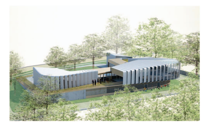
Figure 5. Kesher Synagogue Rear View. See the online article for the color version of this figure.

meaning of the community's name "Kesher," the synagogue functions, maintaining a specific identity for each space within this larger unity.