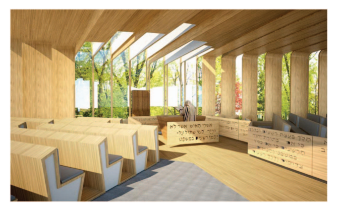
Figure 4. Kesher Synagogue Sanctuary.

The synagogue functions are distributed on a "split level" structure that takes advantage of the site's topographic slope. The main entrance is on the middle level with the sanctuary elevated half a story higher and the social hall and youth center a half level below. These three half-levels minimize the need for excavation and maximize daylight and access to the exterior from all areas of the building. The building creates a seamless flow between indoor and outdoor spaces, making the entire exterior site and roofscape part of the synagogue functional area. The sanctuary opens to the green roof terrace that ramps down to the front courtyard adjacent to the social hall. This large outdoor space accommodates both formal and informal activities and is tied to the paved play and parking area. Through the careful design of the circulation space as well as the indoor—outdoor connection, the building acts as a continuous loop, connecting and tying, as in the Hebrew