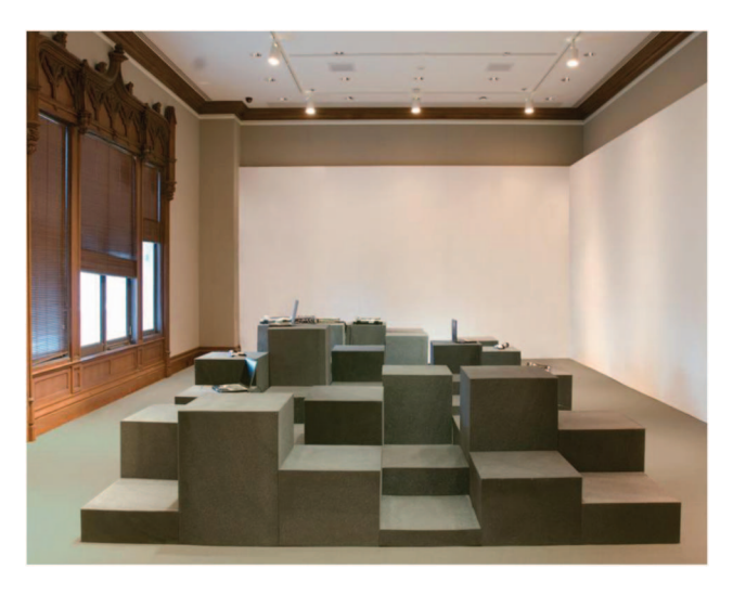
Figure 3. Off the wall Exhibition, Pixilated Mattress. See the online article for the color version of this figure.

Exhibition design is short-lived architecture. It provides an opportunity to integrate the life expectancy of the project into the design process. It highlights the temporality of our construction and the present experience of being-toward-death. However, it also creates a fertile place for playful experimentation with inexpensive materials and unexpected forms